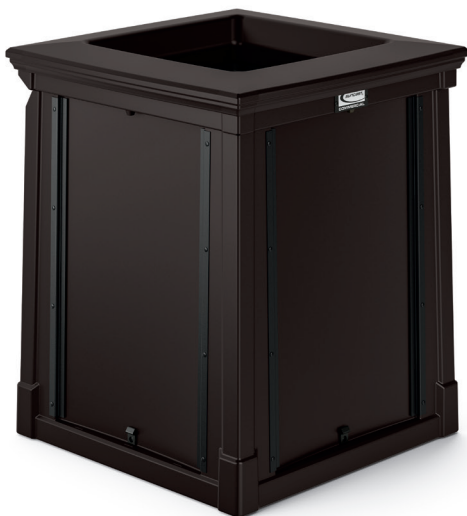
RMCC3502 model shown