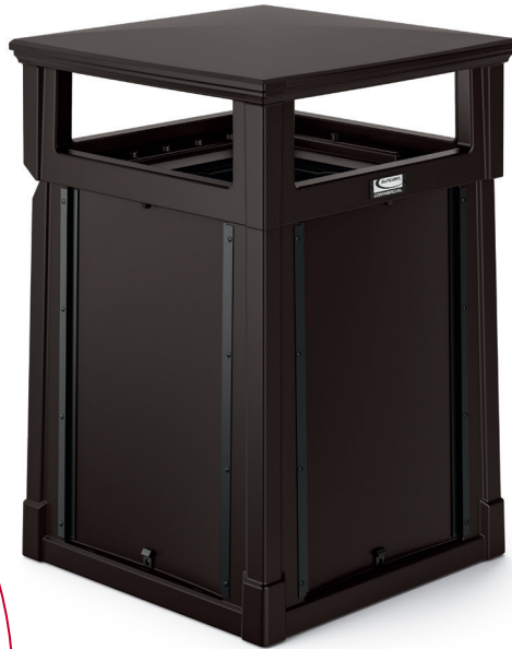
RMCC3501 model shown